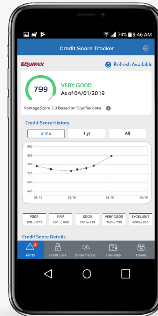
Stay up to date on your VantageScore® credit score and see how it's trending over time.